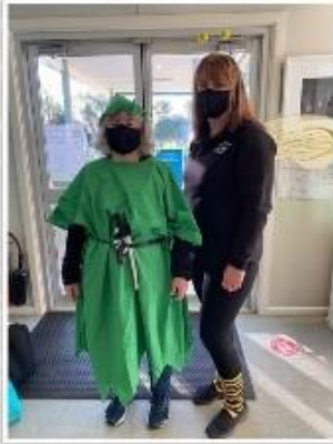
Peter Pan and Willbee the Bumblebee