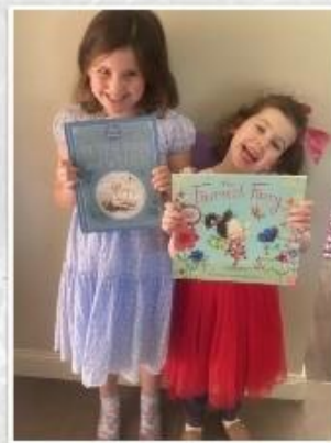
Wendy from Peter Pan and Betty from the Fairiest Fairy